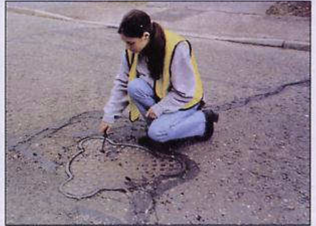
2 Clean out keyholes. (Use a Proteus Keyhole Gouger.)