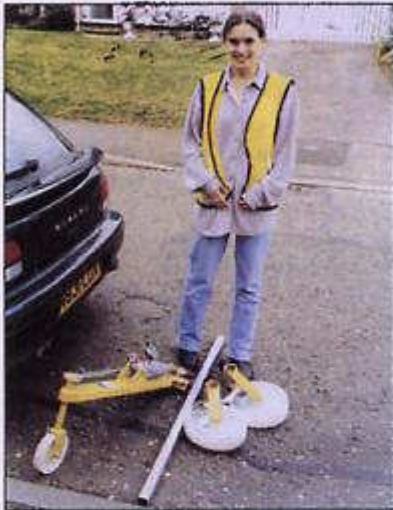
1 Stripped down for small car boot.