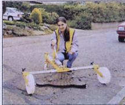
4 Attach keys. Pump.