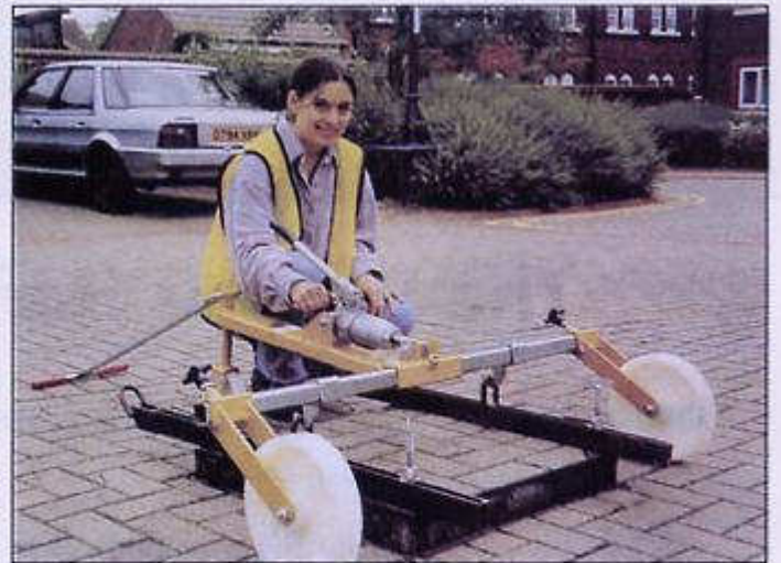
7 Open the valve to re-seat the cover.