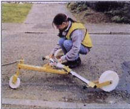
3 Assembly time 20 seconds.