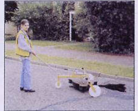
5 Tow cover clear of manhole.